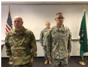
New soldiers sworn into 2nd Bde.

2nd INF BDE soldiers were busy in May. Besides attending AT at Camp Murray, soldiers participated in T.A.R.P training and assisted the Greater Spokane Emergency Management Division in distributing drinking water to residents in the Airway Heights neighborhood. In June, soldiers will participate in the WMD/Terrorism Awareness For Emergency Responders Course (AWR-160). In July, soldiers will participate in the Basic Technical Ham Radio class to secure their FCC Technician Class License and in August, will conduct a walk thru of wilderness survival classes to be taught to the Boy Scouts.