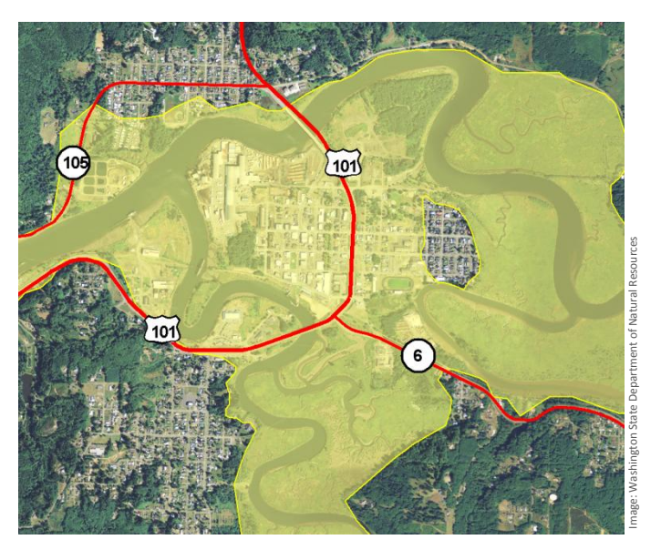
Figure 1. Aerial view of the community of Raymond just east of Willapa Bay on Washington's west coast. The tsunami hazard zone is shaded in yellow. Highways are marked by solid red lines.

All coastal communities along this zone, which extends from northern California to southern British Columbia, will be impacted by the next earthquake and tsunami. The zone has produced earthquakes measuring M8.0 and above at least seven times in the past 3,500 years. The intervals between quakes vary: from as little as 140 years to as much as 1,000. The last one occurred just over 300 years ago. Although scientists cannot predict when the next earthquake will occur, the region is within the window for a significant event.