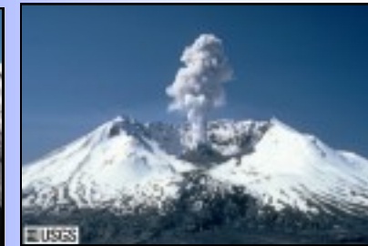
Mt. St. Helens