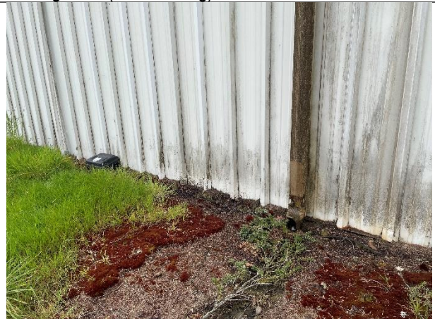
Building Right (North Facing)