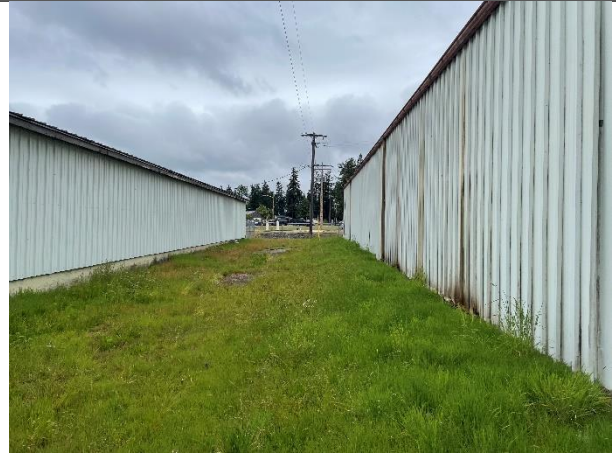
Building Right (North Facing) looking east