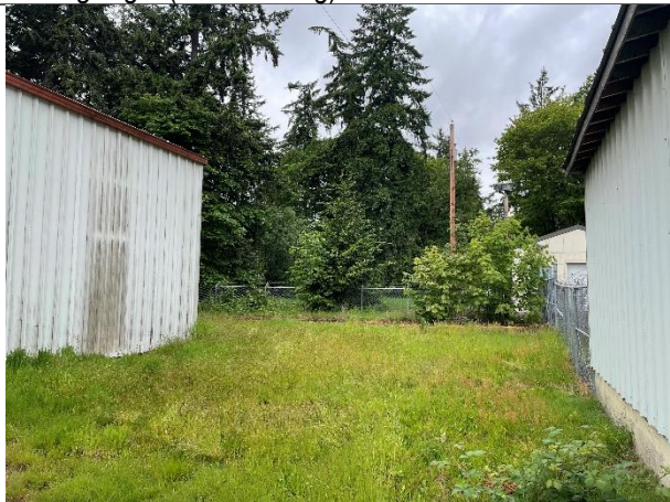
Building Right (North Facing) looking west