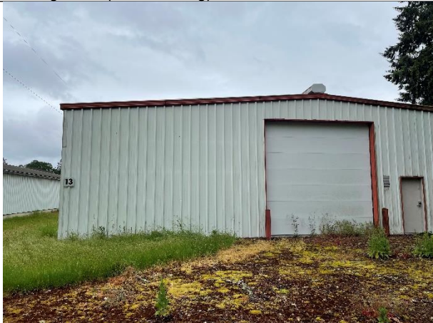
Building Rear (West Facing)