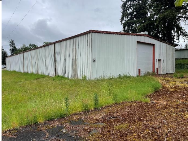
Building Rear (West Facing)