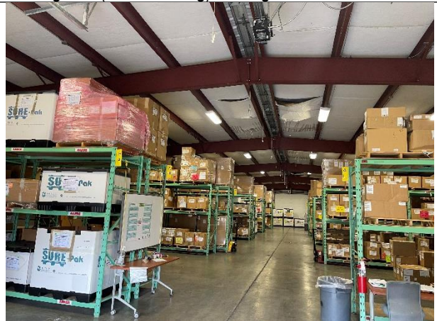
Building Interior from Building Front looking west