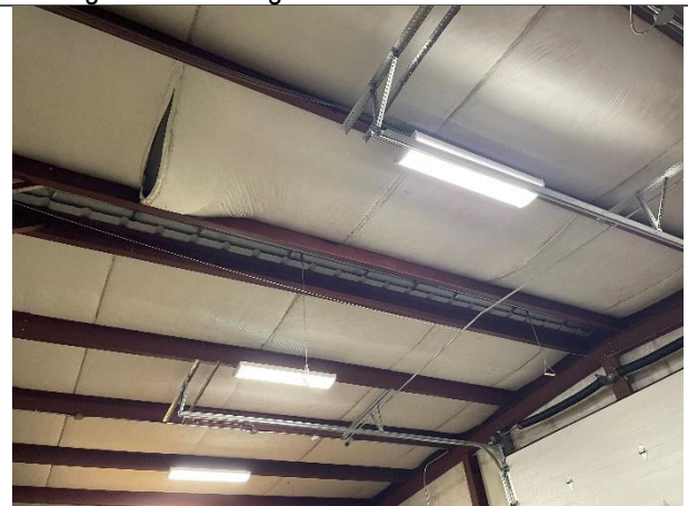
Roof Insulation Blanket and roof framing members