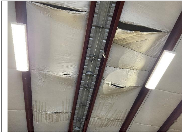
Roof Insulation Blanket and roof framing members