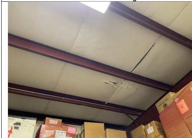
Roof Insulation Blanket and roof framing members