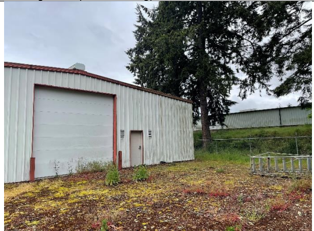
Building Rear (West Facing)