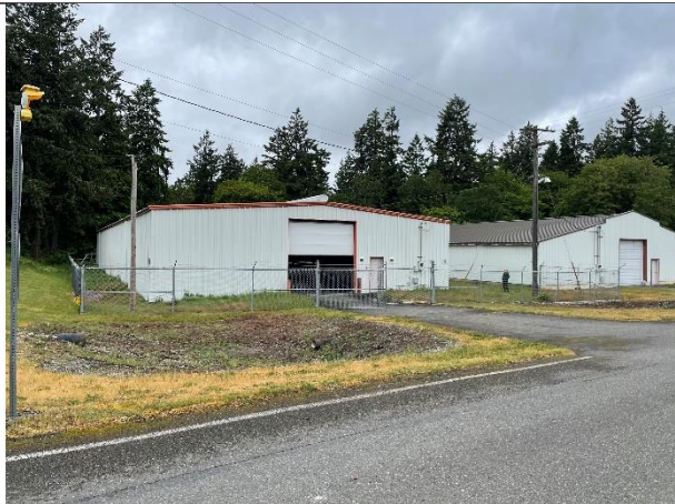
Building Front (East Facing) Building Left (South Facing)

The photographs below are of existing conditions at Building 13 Roof Replacement Site Location for bidder reference.