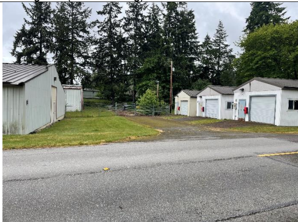
Building Rear access driveway Quatermaster Road