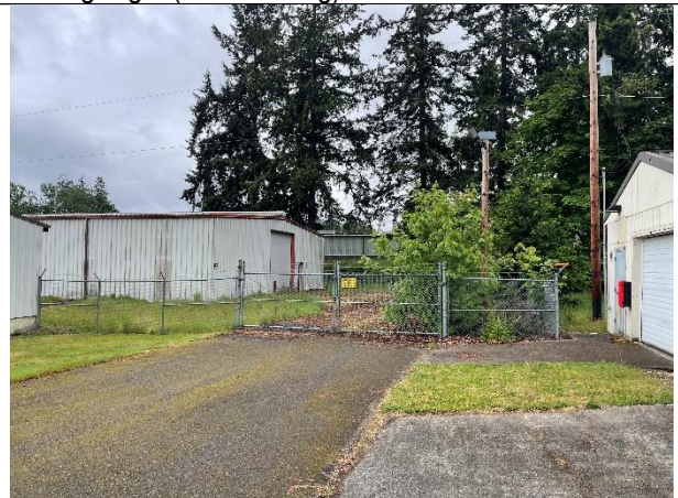
Building Rear access driveway