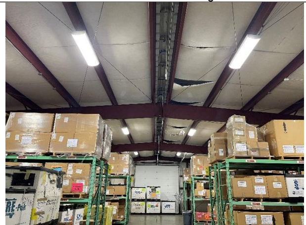
Building Interior looking west