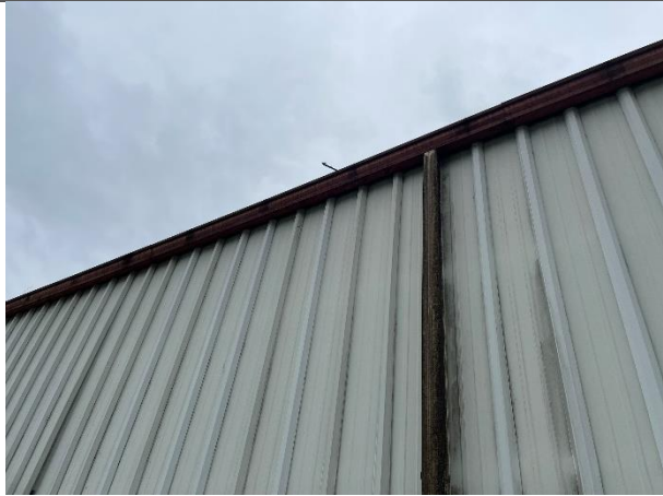
Building Right (North Facing)