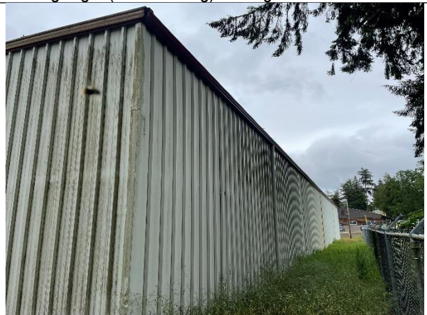
Building Left (South Facing) looking west