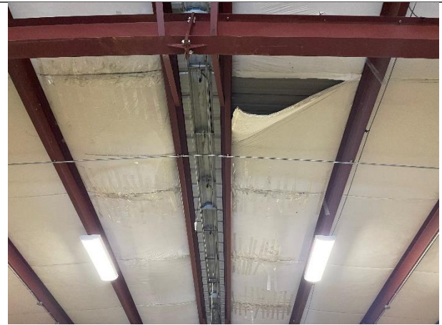
Roof Insulation Blanket and roof framing members