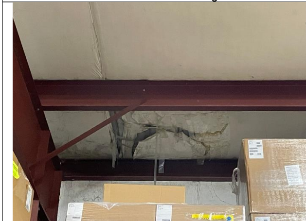
Roof Insulation Blanket and roof framing members