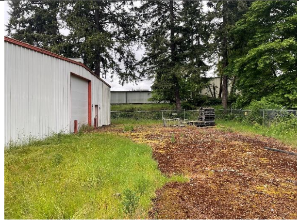
Building Rear (West Facing)