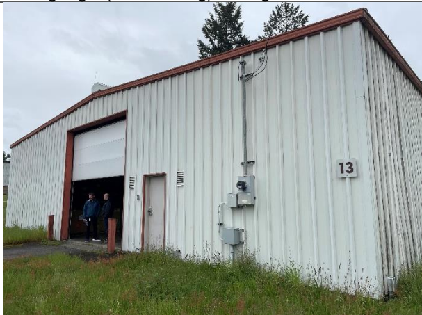
Building Front (East Facing)