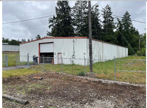
Building Front (East Facing) Building Right (North Facing)