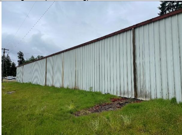
Building Right (North Facing) looking east