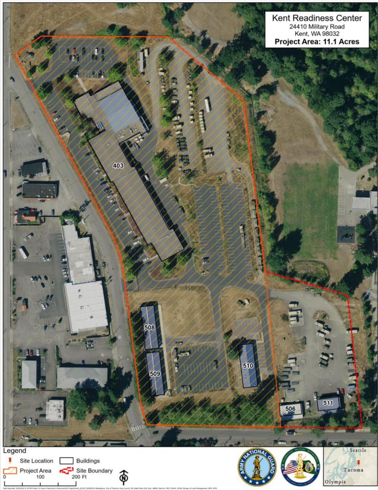
Kent Readiness Center 24410 Military Road Kent, WA 98032 Project Area: 11.1 Acres