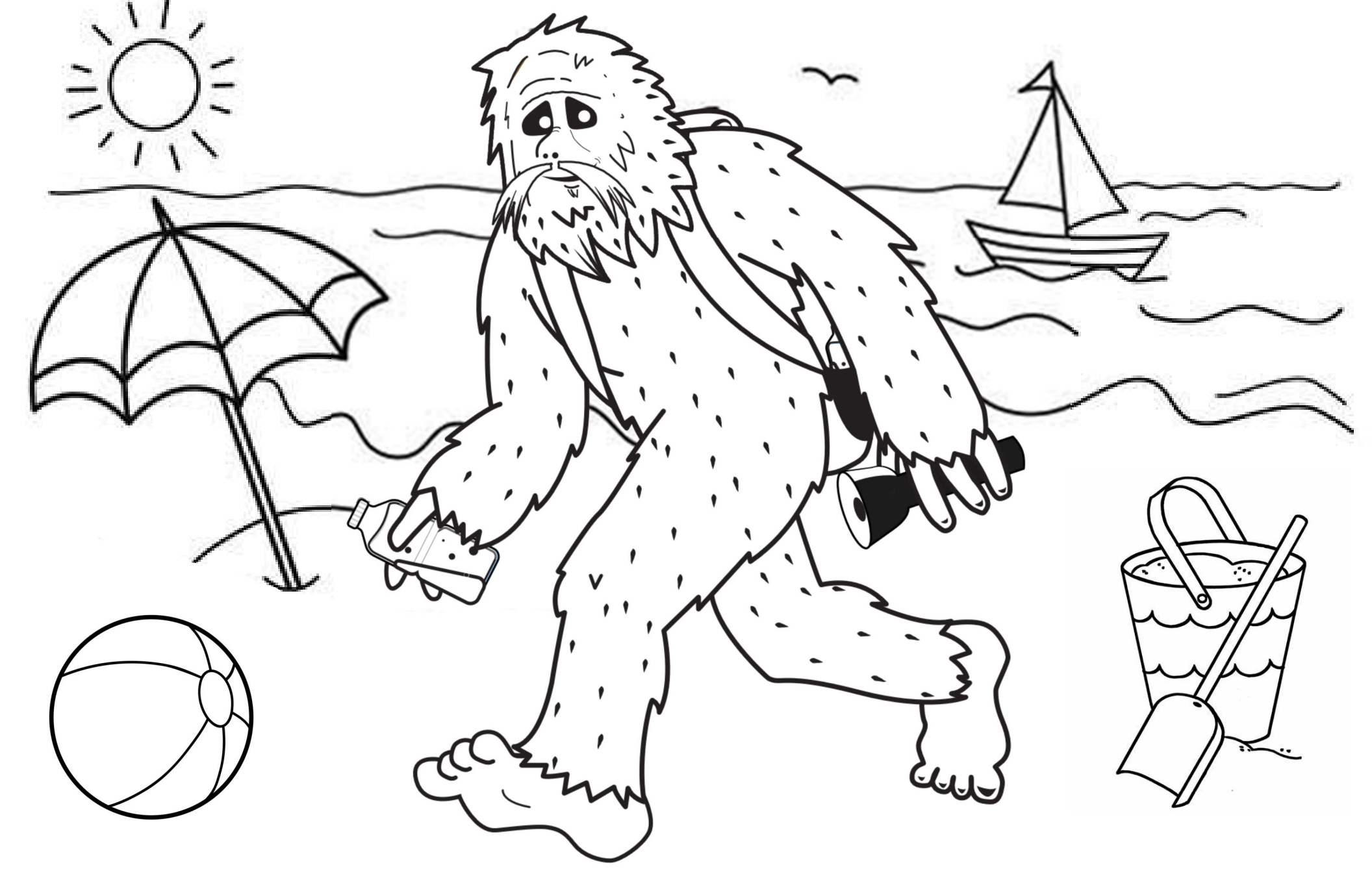
Sasquatch loves visiting the beach! In case of tsunamis, he always comes prepared with his go-bag and makes sure he knows the closest tsunami evacuation route. He also listens for tsunami sirens. Do you know what a tsunami siren sounds like? Ask your parents to take you to