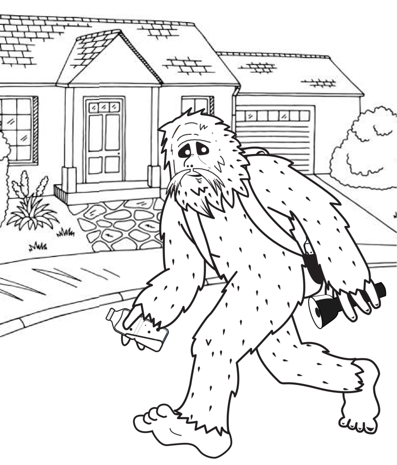
Sasquatch is going across the street to his family meeting place so he can meet up with the rest of his family after the earthquake. He has his go-bag with him. What's in your go-bag?