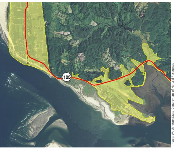
Figure 1. Aerial view of the Shoalwater Indian Reservation between Cape Shoalwater and Toke Point on the southwest coast of Washington. The tsunami hazard zone is shaded in yellow. Highway 105 is marked by a solid red line.

All coastal communities along this zone, which extends from northern California to southern British Columbia, will be impacted by the next earthquake and tsunami. The zone has produced earthquakes measuring M8.0 and above at least seven times in the past 3,500 years. The intervals between guakes vary: from as little as 140 years to as much as 1,000. The last one occurred just over 300 years ago. Although scientists cannot predict when the next earthquake will occur, the region is within the window for a significant event.