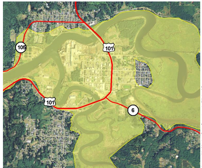
Figure 1. Aerial view of the community of Raymond just east of Willapa Bay on Washington's west coast. The tsunami hazard zone is shaded in yellow. Highways are marked by solid red lines.

All coastal communities along this zone, which extends from northern California to southern British Columbia, will be impacted by the next earthquake and tsunami. The zone has produced earthquakes measuring M8.0 and above at least seven times in the past 3,500 years. The intervals between quakes vary: from as little as 140 years to as much as 1,000. The last one occurred just over 300 years ago. Although scientists cannot predict when the next earthquake will occur, the region is within the window for a significant event.