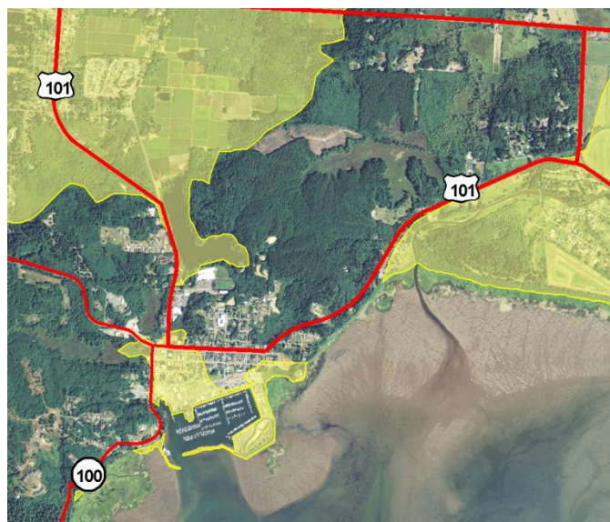
Figure 1. Aerial view of the community of Ilwaco on Washington's southwest coast. The tsunami hazard zone is shaded in yellow. Highways are marked by solid red lines. Baker Bay is in the lower right corner.

All coastal communities along this zone, which extends from northern California to southern British Columbia, will be impacted by the next earthquake and tsunami. The zone has produced earthquakes measuring M8.0 and above at least seven times in the past 3,500 years. The intervals between quakes vary: from as little as 140 years to as much as 1,000. The last one occurred just over 300 years ago. Although scientists cannot predict when the next earthquake will occur, the region is within the window for a significant event.