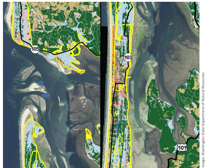
Figure 2. Aerial views of the mouth of Willapa Bay (left) and North Beach Peninsula (right). The solid yellow line marks the tsunami hazard zone. Colored areas show intensity of development (based on land cover data).