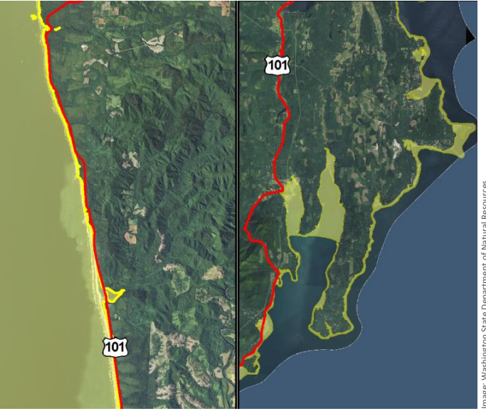
Figure 1. Aerial views of unincorporated areas of Jefferson County's outer (left) and Puget Sound coasts (right). The tsunami hazard zone is shaded in yellow; highways are marked by solid red lines. (For detailed views of particular cities and reservations, see related fact sheets.)

All coastal communities along this zone, which extends from northern California to southern British Columbia, will be impacted by the next earthquake and tsunami. The zone has produced earthquakes measuring M8.0 and above at least seven times in the past 3,500 years. The intervals between guakes vary: from as little as 140 years to as much as 1,000. The last one occurred just over 300 years ago. Although scientists cannot predict when the next earthquake will occur, the region is within the window for a significant event.