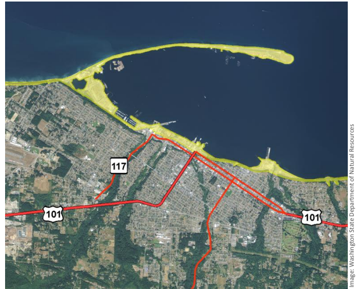
Figure 1. Aerial view of the community of Port Angeles and its harbor on Washington's north coast. The tsunami hazard zone is shaded in yellow; highways are marked by solid red lines.

Much has been done to improve our understanding of tsunami hazards, develop warning systems, and educate the public. If coastal communities are to reduce the impacts of future tsunamis, they need to know how tsunamis will affect their people, property, economy, and infrastructure.