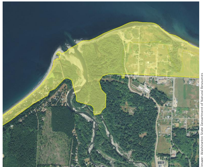
Figure 1. Aerial view of the Lower Elwha Indian Reservation at Angeles Point on the northern coast of Washington. The tsunami hazard zone is shaded in yellow. The Elwha River can be seen just left of center.

All coastal communities along this zone, which extends from northern California to southern British Columbia, will be impacted by the next earthquake and tsunami. The zone has produced earthquakes measuring M8.0 and above at least seven times in the past 3,500 years. The intervals between quakes vary: from as little as 140 years to as much as 1,000. The last one occurred just over 300 years ago. Although scientists cannot predict when the next earthquake will occur, the region is within the window for a significant event.