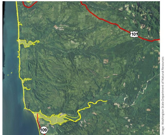
Figure 1. Aerial view of the exposed coastal area of the Quinault Indian Reservation. The tsunami hazard zone is shaded in yellow. Highways are marked by solid red lines. The largest river is the Quinault (crossing the bottom of the image from right to left).

All coastal communities along this zone, which extends from northern California to southern British Columbia, will be impacted by the next earthquake and tsunami. The zone has produced earthquakes measuring M8.0 and above at least seven times in the past 3,500 years. The intervals between quakes vary: from as little as 140 years to as much as 1,000. The last one occurred just over 300 years ago. Although scientists cannot predict when the next earthquake will occur, the region is within the window for a significant event.