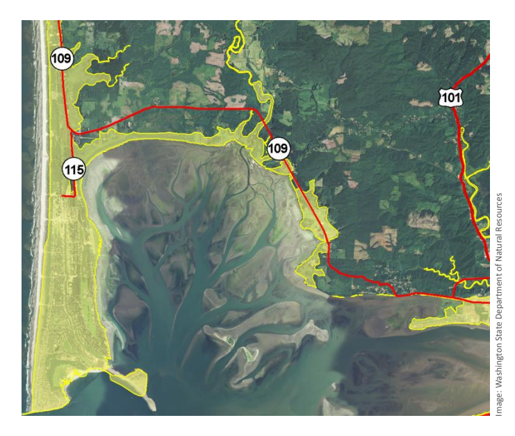
Figure 1. Aerial view of the community of Ocean Shores between Grays Harbor (center) and the Pacific Ocean (far left). The tsunami hazard zone is shaded in yellow; highways are marked by solid red lines.

All coastal communities along this zone, which extends from northern California to southern British Columbia, will be impacted by the next earthquake and tsunami. The zone has produced earthquakes measuring M8.0 and above at least seven times in the past 3,500 years. The intervals between quakes vary: from as little as 140 years to as much as 1,000. The last one occurred just over 300 years ago. Although scientists cannot predict when the next earthquake will occur, the region is within the window for a significant event.