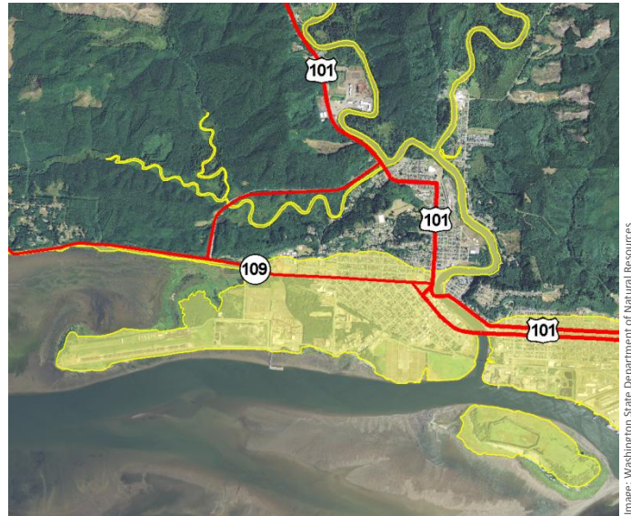
Figure 1. Aerial view of the community of Hoquiam on the Pacific coast of Washington. The tsunami hazard zone is shaded in yellow. Highways are marked by solid red lines.

Much has been done to improve our understanding of tsunami hazards, develop warning systems, and educate the public. If coastal communities are to reduce the impacts of future tsunamis, they need to know how tsunamis will affect their people, property, economy, and infrastructure.