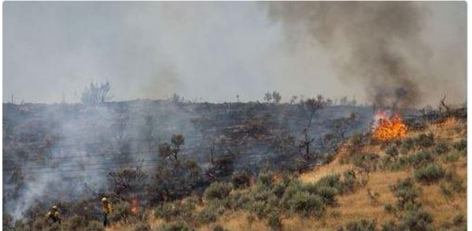
South Wenas Fire, Yakima County, WA 6/27/2017