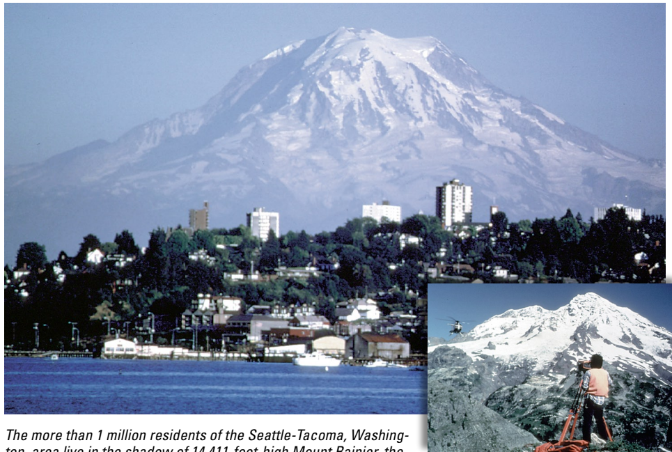
The more than 1 million residents of the Seattle-Tacoma, Washington, area live in the shadow of 14,411-foot-high Mount Rainier, the tallest volcano in the United States outside of Alaska. Several communities near the volcano, built on the deposits of giant lahars of volcanic ash and debris that are less than 1,200 years old, are at risk from similar future lahars. Inset photograph shows a U.S. Geological Survey (USGS) scientist monitoring the volcano for signs of subtle ground movement that might lead to an eruption or landslide.

When Cascade volcanoes do erupt, high-speed avalanches of hot ash and rock