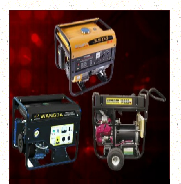
Use your generator properly. Read the instruction manual.